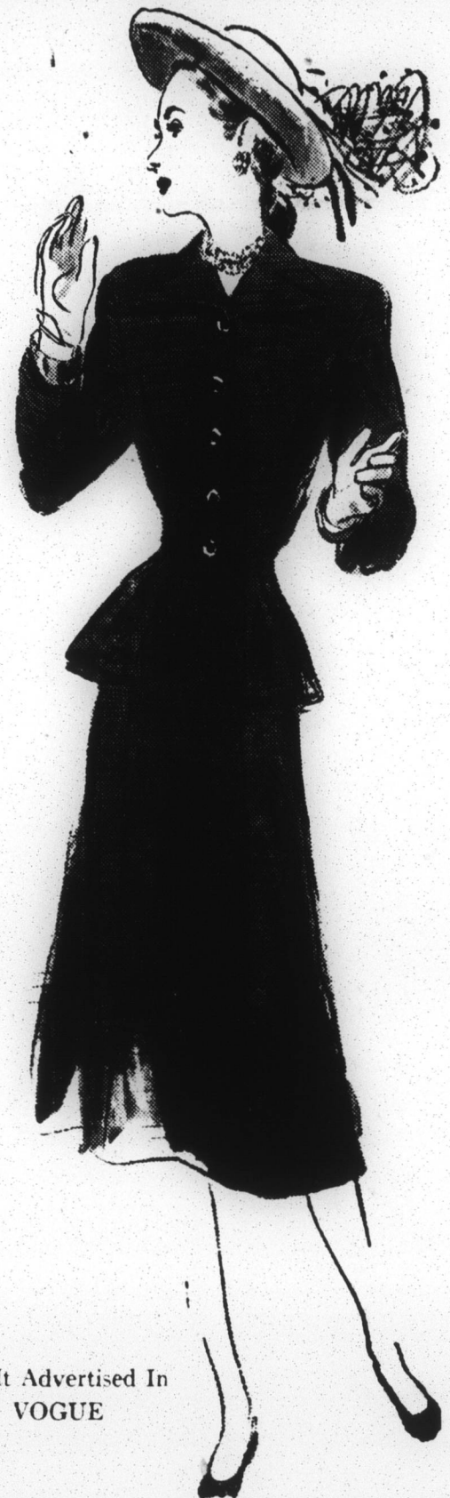
See It Advertised In VOGUE

Bob Hope and Dorothy Lamour in "MY FAVORITE BRUNETTE"