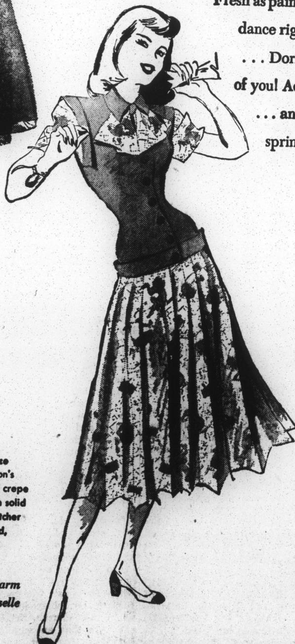
Oh, My Correspondence... Doris Dodson's rayon pigment crepe print dress with solid color rayon butcher linen jersey. Red, violet, or lime. 9-15. $16.95

Fresh as paint... young prints that dance right off a painter's palette... Doris Dodson's impressions of you! Add them to your collection... and make it the prettiest spring you've ever known.