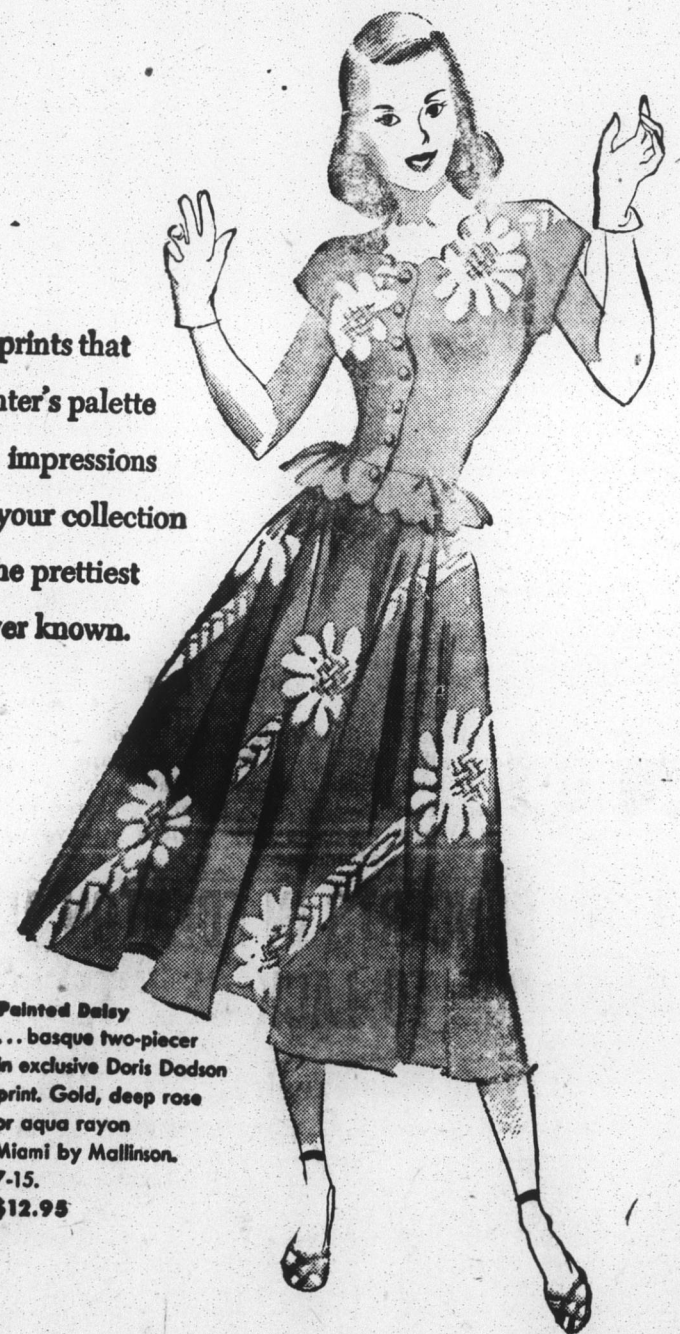
Painted Daisy... basque two-piecer in exclusive Doris Dodson print. Gold, deep rose or aqua rayon Miami by Mallinson. 7-15. $12.95