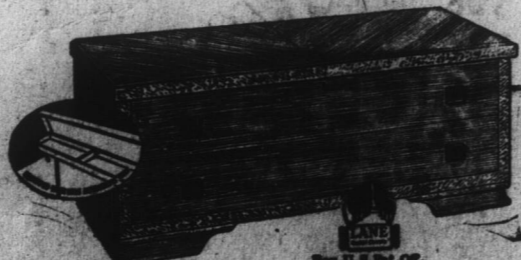
Chest No. 226