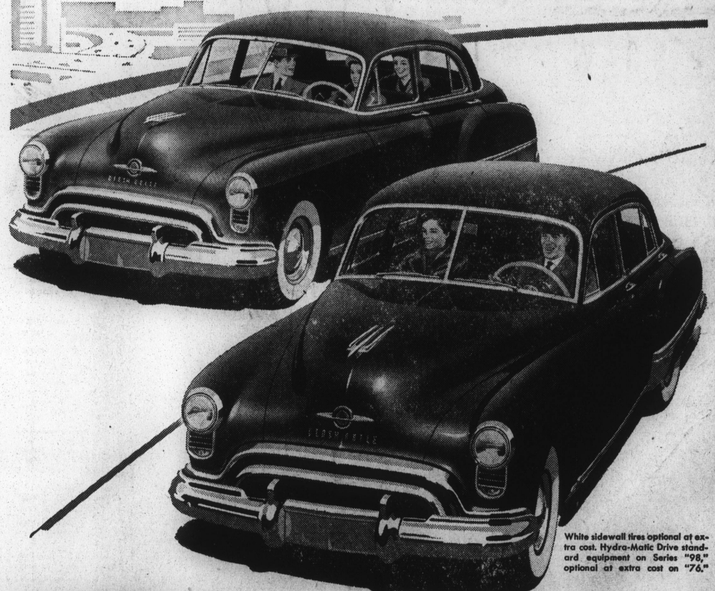
White sidewall tires optional at extra cost. Hydra-Matic Drive standard equipment on Series "98," optional at extra cost on "76."