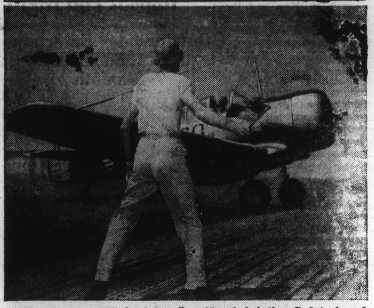
Engine "revved up" for take-off, a Naval Aviation Cadet aboard the practice carrier USS Wright at Pensacola Naval Air Station gets the go-ahead signal from the flight dispatcher of an air group. Pensacola Naval Air Station, the "Annapolis of the Air," is the focus of the recently reactivated Naval Aviation Cadet training program, which is open to healthy, single young men between 18 and 25, with at least two years of college. Upon graduation they are commissioned ensigns in the Naval Reserve, or second lieutenants in the Marine Corps Reserve, are awarded their wings and assigned to two years' active duty.

HAJOCA branch, serving Norfolk and the Student Council, read some of the the exhibition is not designed to com- The constitution says that in an elecplies on a smaller scale where local may be seconded instead of should be. purchasing agents, plant engineers and maintenance men have a real op- 4th, when the annual May Day Fesportunity of furthering their knowl- tival will be held on the Green. On