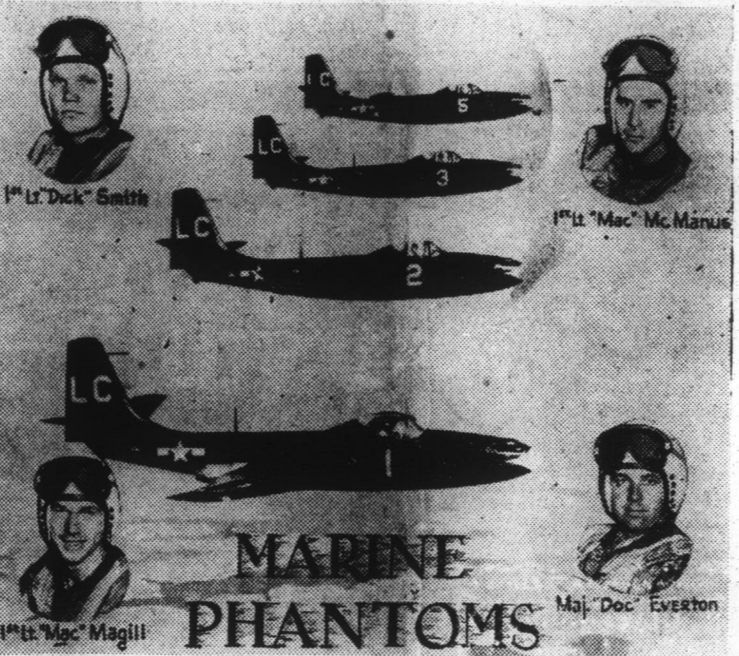
Pictured above are the four famous "Marine Phantoms" of Marine Fighting Squadron 122, who will thrill spectators at an air demonstration and carnival to be staged at the Edenton Marine Corps Air Station Saturday afternoon, starting at 3 o'clock. The "Marine Phantom" pilots will perform in their latest type jet aircraft.