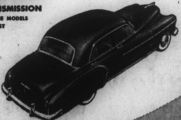
All cars shown are Styleline De Luxe 4-Door Sedans

America's Best Seller CHEVROLET America's Best Buy