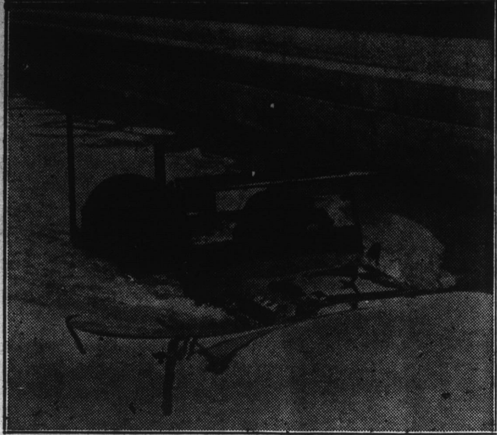
BATH FOR WATER-PROOF ARMY JEEP —At Aberdeen Proving Ground this jeep is tested under water. Its engine is waterproofed. Two pipes, one at the windshield and the other at the rear of the vehicle, are breather and exhausts. While submerged the ignition may be turned off and the motor restarted. The driver is equipped with a rubberized suit.

Bad lights topped the list of defects, with approximately 300 buses in this category. Approximately 200 had defective sun visors, while bad brakes and faulty window glass were found in 100 cases each. Around 150 buses were dirty. Approximately 50 had faulty exhausts, six had emergency