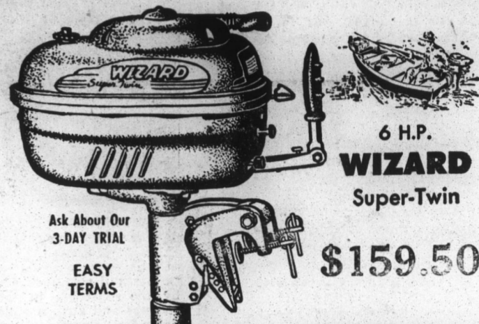
6 H.P. WIZARD Super-Twin

Several popular models of aluminum and wood boats will also be on display.