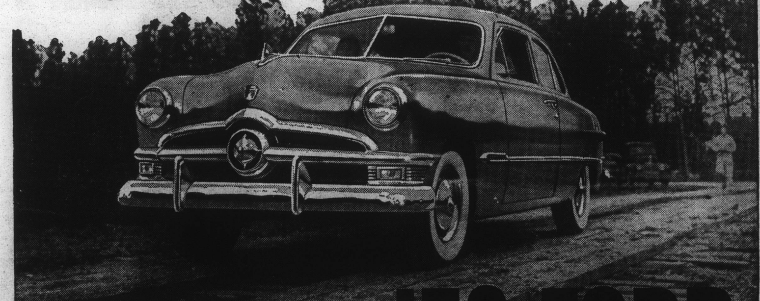
White sidewall tires available at extra cost

"TEST DRIVE" THE ONE FINE CAR IN THE LOW-PRICE FIELD!