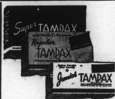
Sold In Edenton by Mitchener's Pharmacy

overloaded. Value of cars and property returned to individuals following thefts was estimated at $50,000. Fines in cases brought to trial totaled $191,192.42, which was turned over to the county school funds. Costs amounted to $86,801.52, which went to county general funds in counties where cases