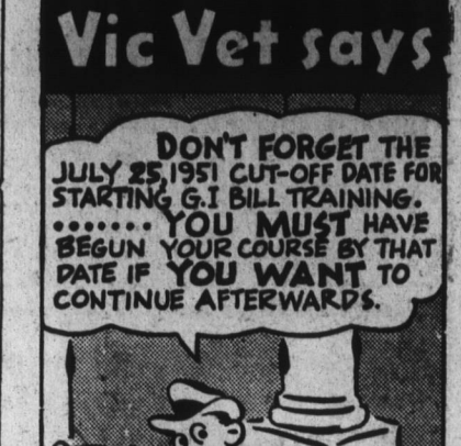
For full information contact your nearest VETERANS ADMINISTRATION office

with this information and the names zation.