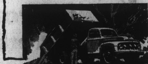
All heavy duty F-5 and F-6 Fords for '51 like this Dump, give you easier, quieter shifting with new, 4-Speed Synchro-Silent transmission, optional at extra cost.

POWER PILOT ECONOMY... and many other money-saving advancements!