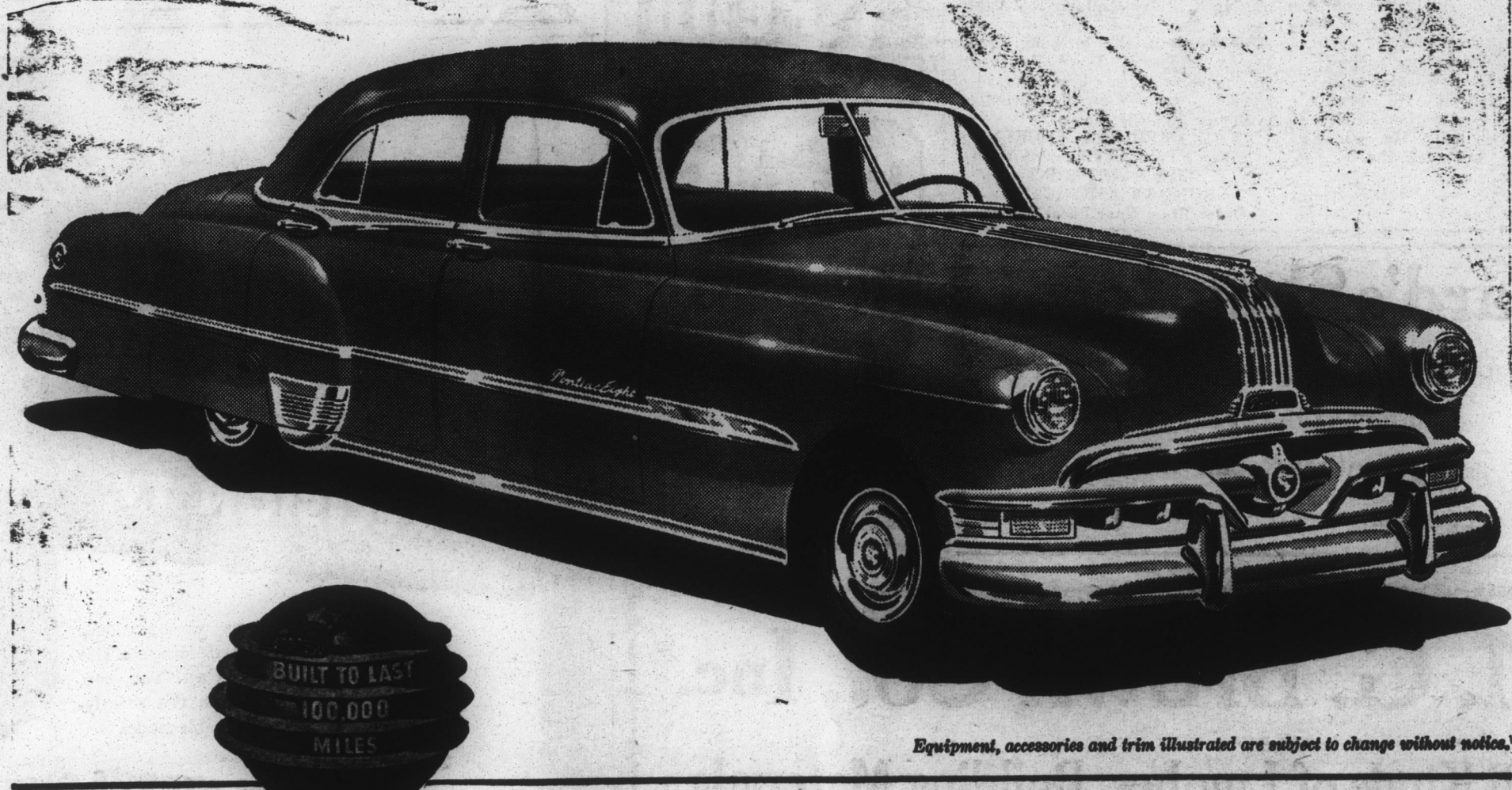
Equipment, accessories and trim illustrated are subject to change without notice.