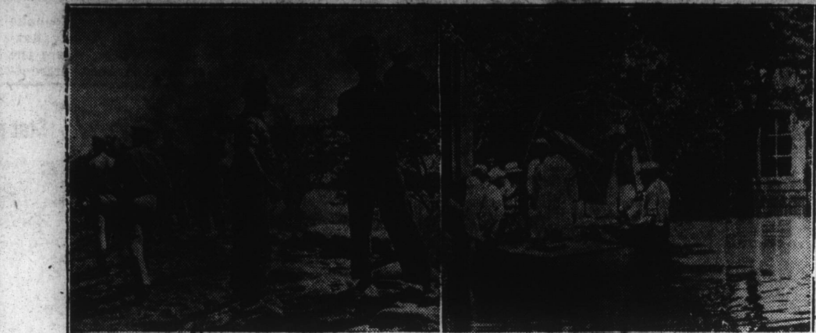
AIR FORCE ASSISTANCE TO FLOOD VICTIMS —Soldiers from Forbes Air Force Base at Topeka, Kansas, worked 24-hour duty to help strengthen a threatened levee when raging flood waters endangered the Topeka and Kansas City areas. Right, Air Force "swampbuggy" (a light draft boat powered by an airplane propeller) is loaded with supplies for flood victims. This was an effective means of transportation over inundated streets.