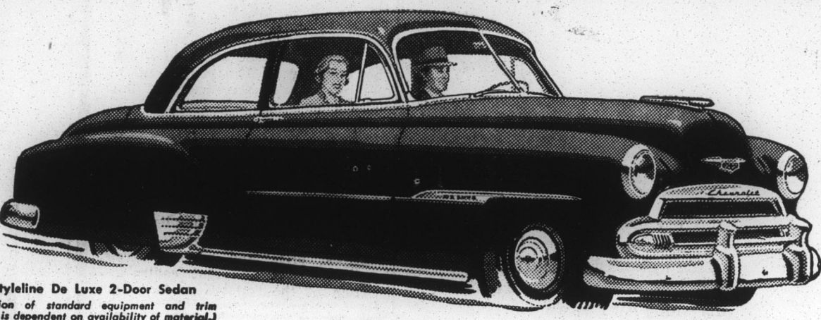
The Styleline De Luxe 2-Door Sedan (Continuation of standard equipment and trim Illustrated is dependent on availability of material.)

SERVICE WHEN YOU NEED IT! Complete Line of Polishes Any Leather Repair Work WEST EDEN STREET PHONE 46-W