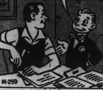
For full information contact your nearest VETERANS ADMINISTRATION office

YOU CAN'T SWITCH FROM A GI BILL CORRESPONDENCE COURSE TO CLASSROOM TRAINING AFTER THE JULY 25 CUT-OFF DATE, BUT YOU CAN GO AHEAD WITH ADVANCED GI BILL CORRESPONDENCE TRAINING IN THE SAME FIELD