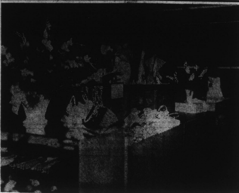
Above is pictured an interior view of The Betty Shoppe at the corner of Broad and Eden Streets, now housed in a new and up-to-date home. The picture was taken during Open House Week, when hundreds of people visited the attractive and well stocked store and registered for free prizes.