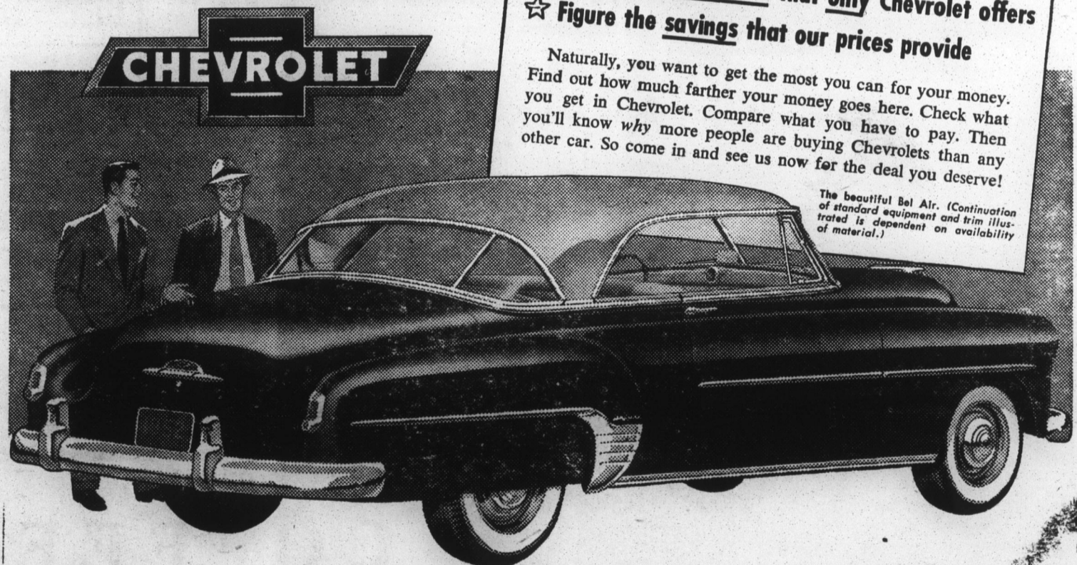
The beautiful Bel Air. (Continuation of standard equipment and trim illustrated is dependent on availability of material.)

Naturally, you want to get the most you can for your money. Find out how much farther your money goes here. Check what you get in Chevrolet. Compare what you have to pay. Then you'll know why more people are buying Chevrolets than any other car. So come in and see us now for the deal you deserve!