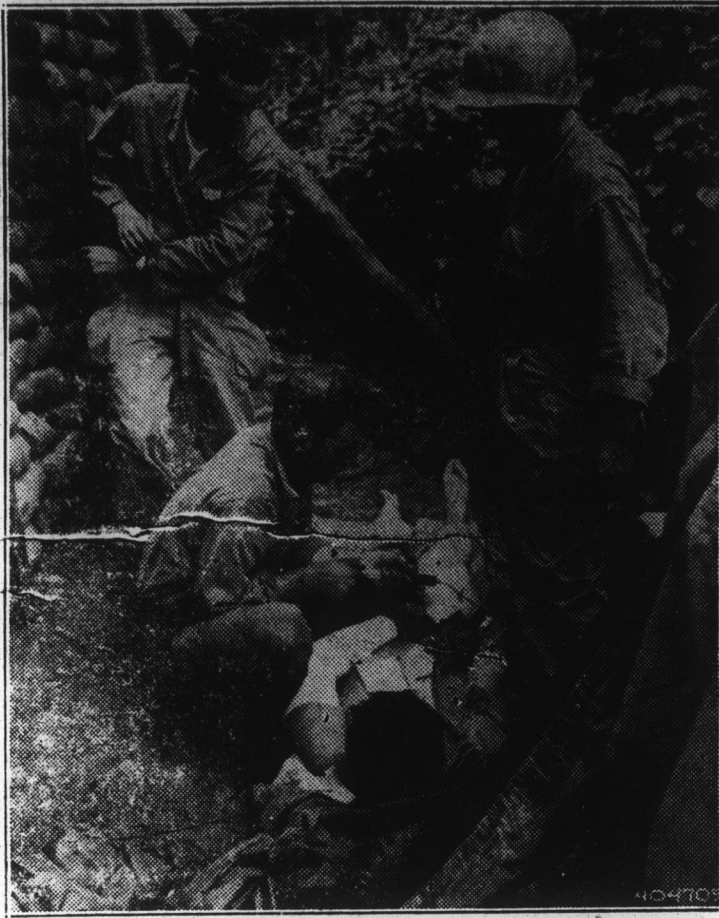
A WOUNDED SOLDIER received blood plasma just a few yards from where he was hurt in Korea. Army Medical Corps men have reduced the death rate among wounded who reach medical care to 2.4 per cent, compared to 4.5 per cent in World War II and eight per cent in World War I.

"I hear you had dancing at your lawn party yesterday." "It was quite unpremeditated; one of the guests accidentally upset a beehive."