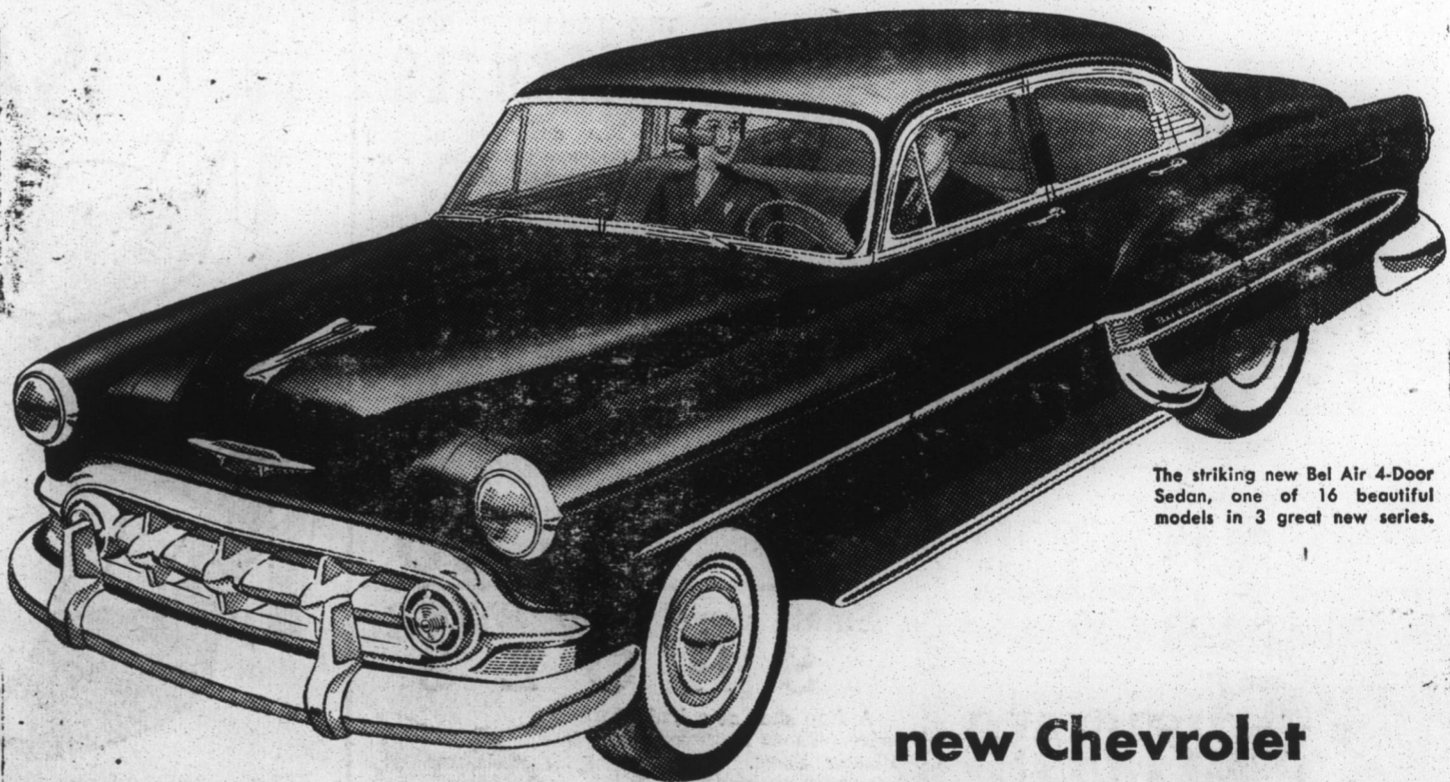
The striking new Bel Air 4-Door Sedan, one of 16 beautiful models in 3 great new series.