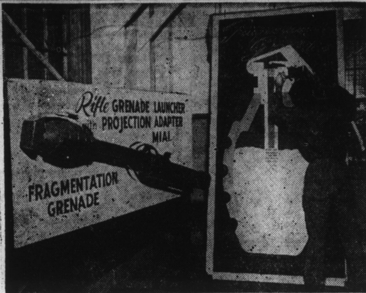
"BLOW-UP" BOMB—A grenade, adapted for firing by the Army rifle, is illustrated in the training aid shown at left. At right, a Camp Gordon, Ga., instructor tests the spring handle of a 10-foot cross-view of the hand bomb.