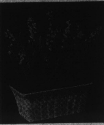
Lilies of the Valley Will Flower in Three Weeks.

Paper whites are placed in a bowl and held upright by pebbles packed around them. Water is poured in the bowl, and replenished as needed. It is best to keep the bowl in a cool, dark place until roots form and top growth begins. Then bring them into the light and give a day temperature