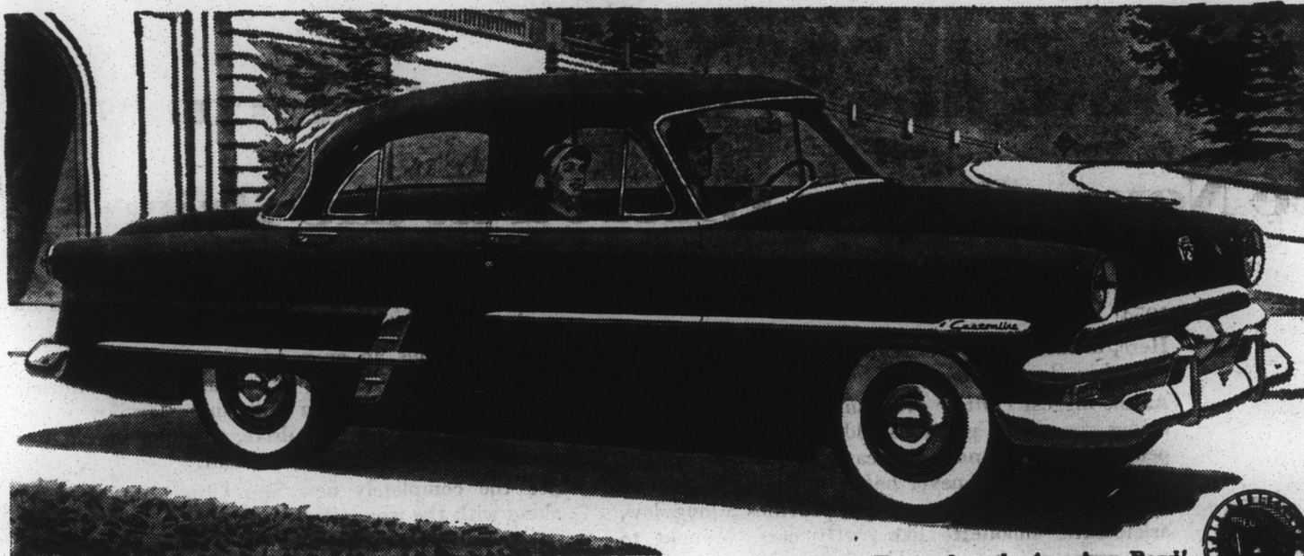
Fifty Years Forward on the American Road!

FORD'S CRESTMARK BODY is hull-tight to seal out weather and noise. Its lower, wider, longer look sets the style, its Full-Circle visibility adds to your safety.