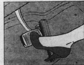
Power brakes for easier stops

with POWER BRAKES, AUTOMATIC WINDOW and SEAT CONTROLS