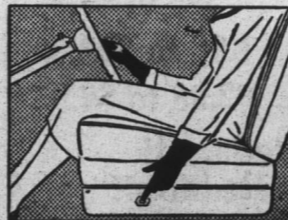
New, automatic window and seat controls

Now Chevrolet brings you Power Brakes to make stopping wonderfully easy and convenient. Optional on Powerglide models at extra cost.