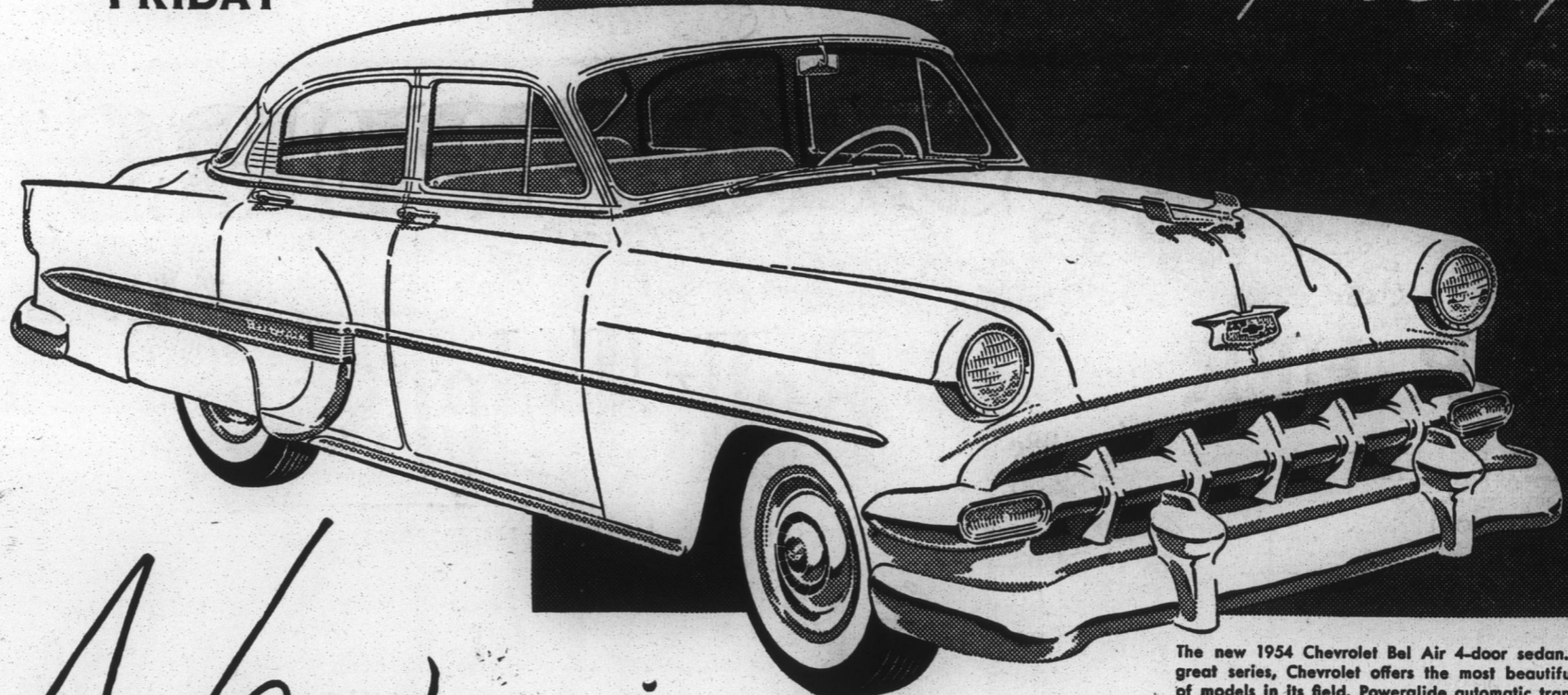
The new 1954 Chevrolet Bel Air 4-door sedan. With 3 great series, Chevrolet offers the most beautiful choice of models in its field. Powerglide automatic transmission now available on all models, optional at extra cost.