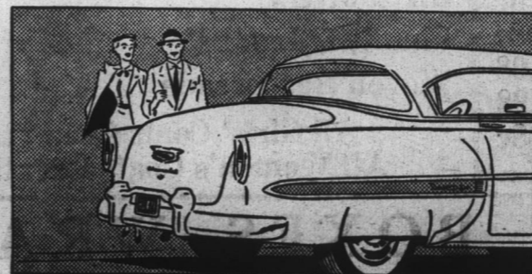
New styling that will stay new

The touch of a button adjusts front seat and windows. Optional on Bel Air and "Two-Ten" models at extra cost.