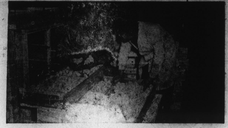
THE U.S. ARMY supplied high quality hatching eggs to improve South Korean poultry. the bros