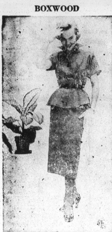
BOXWOOD Cotton conquers new worlds as it moves into the winter fashion field. This Fall-into-Winter ensemble is styled in Avondale's new boxwood, a textured novelty woven cotton. Featured in a black and white diamond pattern, the ensemble has a hip-length blouse with slit pockets on either side of the peplum. It's cinched at the waist with a narrow patent leather belt. Skirt with inverted back pleat completes the team.

The examination, which will be held in Norfolk, Richmond and Roanoke, Va.; Charlotte and Raleigh, N. C., and Baltimore, Md., as well as other cities throughout the country, is open to men between the ages of 17 and 22 who are high school seniors or graduates with 15 units earned by June 30, 1954. The units must include three in English, two in algebra and one each in plane geometry