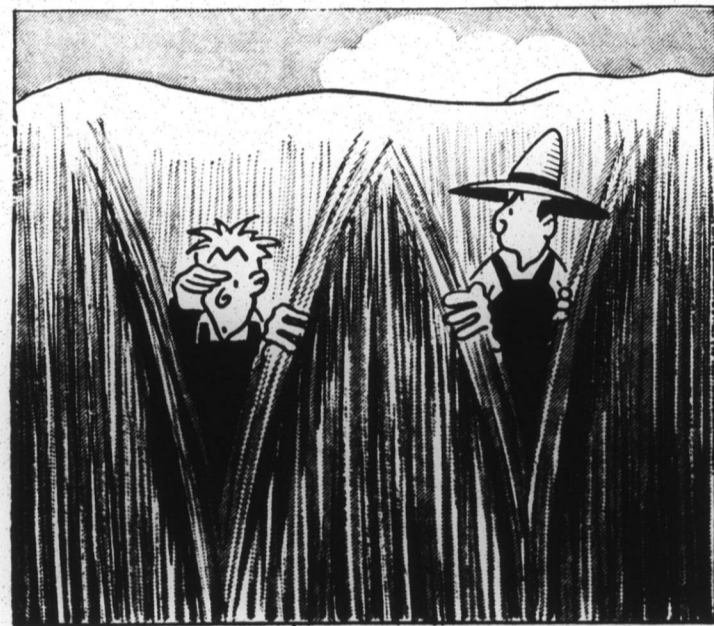
"Can't find the combine. I told you about using that Smith-Douglass Fertilizer."

And They Need Dough Old Gentleman—I hear that your big brother is going to be a baker. Tommy—Yes, but father's afraid he'll become lazy. Old Gentleman—Oh, why? Tommy—Because all bakers are loafers.