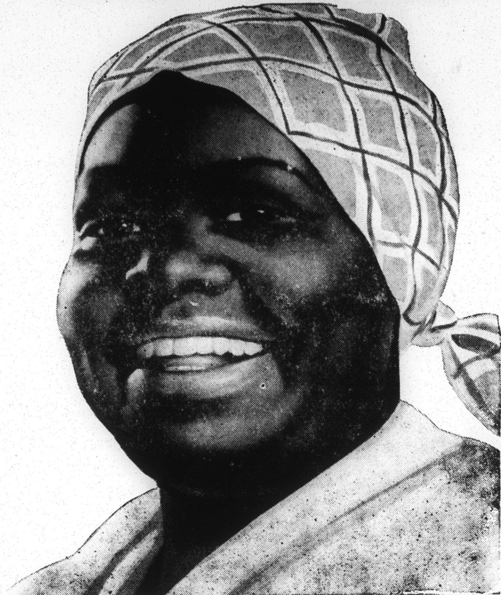
Aunt Jemima, known from coast to coast by every generation as the symbol of pancakes, will appear in person at the P & Q Super Market Friday and Saturday of this week. Aunt Jemima will conduct pancake demonstrations in the store and will serve pancakes free to visitors in the store.