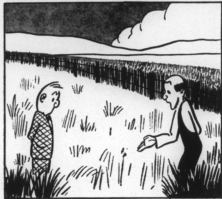
"He 'saved' money by cutting back on fertilizer!"

Save with fertilizer, not on it. Smith-Douglass Fertilizer applied at recommended rates reduces production cost per bushel or pound. Unless you're already using more than recommended, more fertilizer—not less—is the way to lower your production cost and increase your profit. S-D Fertilizer in the right amount reduces unit production cost by increasing yield and quality per acre. Let the nearby S-D Fertilizer representative help you keep your income up!