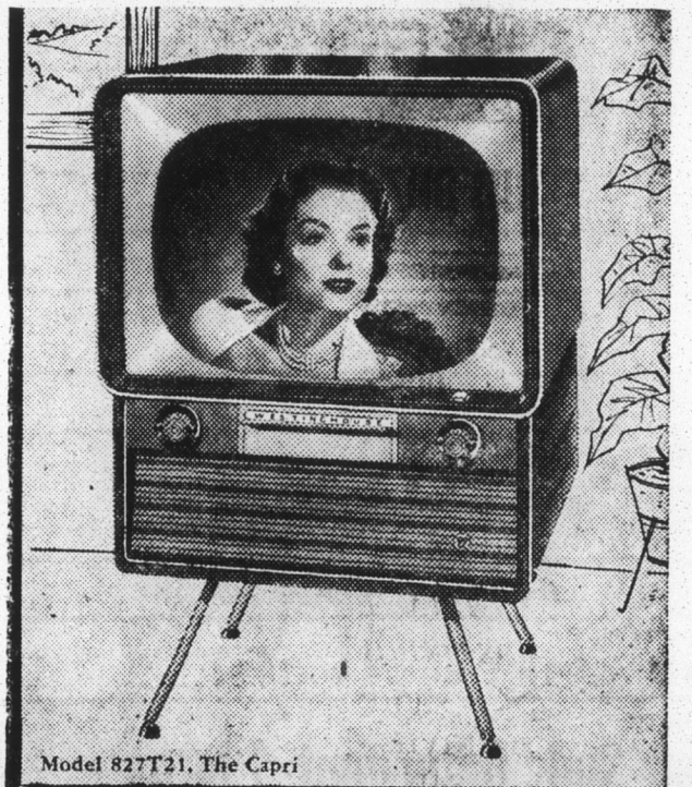
Model 827T21, The Capri