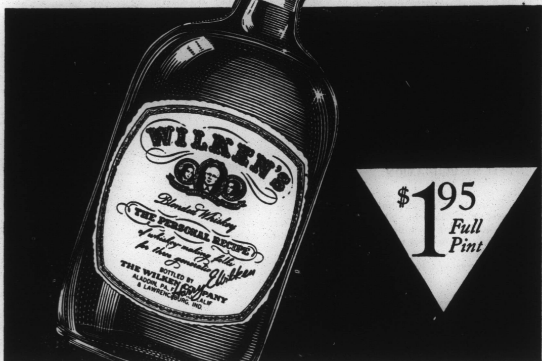
THE WILKEN CO., LAWRENCEBURG, IND. • BLENDED WHISKEY • 85 PROOF • 72% GRAIN NEUTRAL SPIRITS