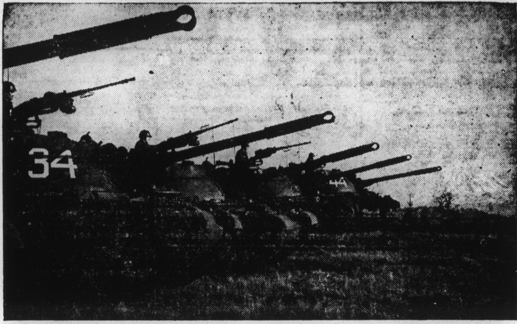
TANK-HITTING PATTON 48 TANKS, on maneuvers at Fort Lewis, Wash., line up breast in firing position. Snow-capped Mount Rainier looms in the background.