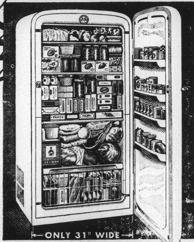
Only 31 inches wide, yet holds 630 lbs. of food. Kelvinator Upright, Model FR-18V illustrated. Built by the oldest maker of electric refrigerators for the home. Powered by the famous Kelvinator Polarsphere cold-maker.

Start by Saving $100 on this new KELVINATOR Freezer