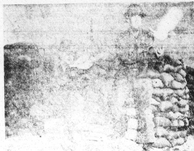
PIGEONS ARE WALK BIRDS—From Bell Run to Heartbreak Ridge, carrier pigeons have helped their way carrying messages for the U.S. Army. Here a member of the Army "Pigeon Force" takes to the air in training as they are released by members of an Army Signal Battalion.