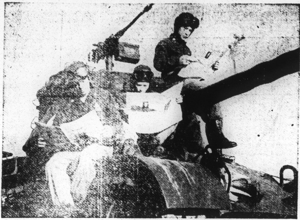
KEEPING UP WITH THE NEWS, these U.S. soldiers overseas take time out from their daily tasks to catch up on world events as reported by Stars & Stripes.