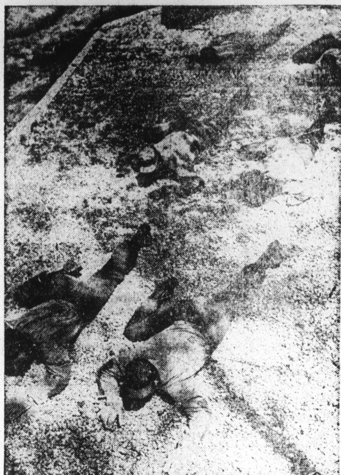
MOVING ON ITS STOMACH , this portion of the U.S. Army literally does what Napoleon said all armies do. These soldiers belly their way across a gravel pit at the Quartermaster Corps' test center at Fort Lee, Va., to find weak spots in experimental Army clothing.

Trees can be kept fresh in the house if they are placed in a hold-containing water. Make a fresh cut across the base of the tree on