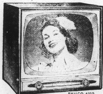
Philco 24" TV at a 21" Price!

Giant picture! Giant value! Peak performing TV in space-saving custom-styled Maroon finish cabinet! Finger Tip Tuning and power-proved chassis. Built-in UHF-VHF Aerial. See, compare it now!