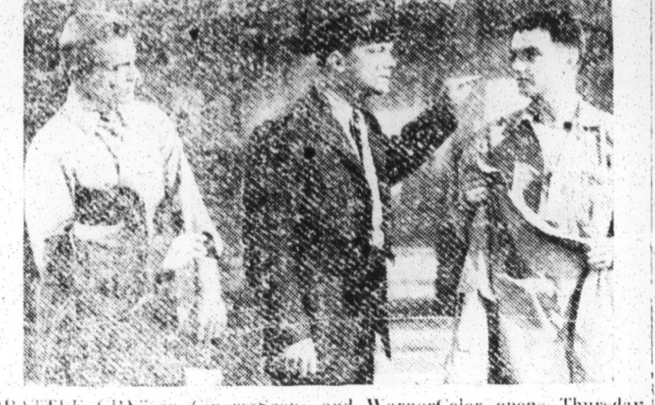
"BATTLE CRY" in CinemaScope and WarnerColor opens Thursday at the Taylor Theatre. TAB HUNTER, ALDO RAY and WILLIAM CAMPBELL are members of the squad made famous by Leon Uris in his novel of the wartime loves of a group of Marines. Raoul Walsh directed.

Sidekick Sarcasm Excited Owner—I left my midget car here five minutes ago and it's gone. Policeman—Have you felt your pockets?