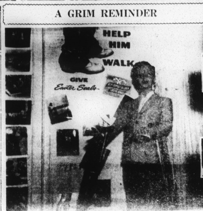
Officials of the Edenton Lions Club, sponsors of the 1955 Easter Seal Sale campaign, take this novel means of calling attention of Chowan County residents the dire need of their contributions in helping to rehabilitate handicapped children like the youngster shown above. The exhibit is being displayed in Belk-Tyler's show window.