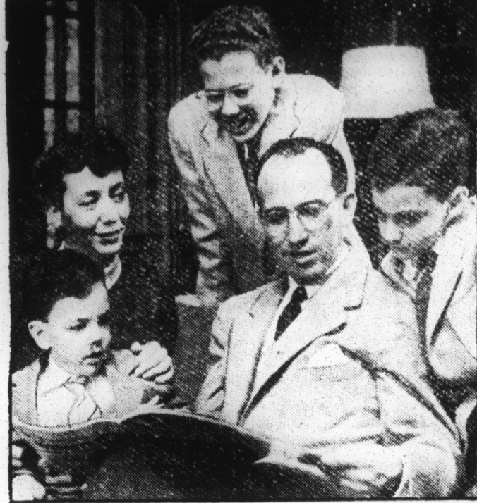
Dr. Jonas E. Salk, who developed the polio vaccine named in his honor, poses with wife, Donna, and their three sons. Among first to receive inoculations during the test run in 1954 the boys are, from left: Jonathan, 5, Peter, 11, and Darrel, 8.