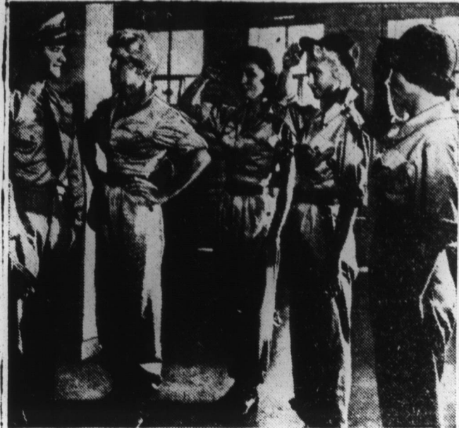
JACK LEMMON MEETS THE GIRLS in the comedy sensation of Broadway, "Mister Roberts," now in CinemaScope and WarnerColor at Taylor Theatre four days beginning September 25. Lemmon is seen in the role of the romantic Ensign Pulver, whose boy-play with the nurses led by Betsy Palmer (standing nearest to Lemmon), provides a laugh highlight in the film.

So, before the Eisenhower Administration began, when the Democrats