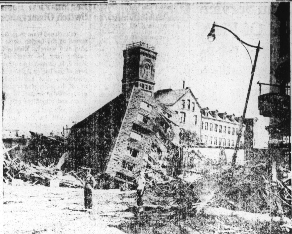
CRUSHED AND BROKEN, this 16-family apartment house in Waterbury, Conn., was left high and dry after the rampaging Naugatuck River re-destroyed 1,326 houses and badly damaged 4,808.

The reason why men enter into society is the preservation of their property. —John Locke.