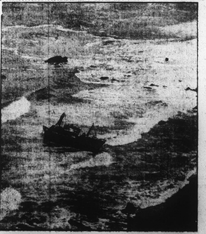
TOY OF THE STORM—It's not a toy boat, abandoned on a placid beach by some child. This powerful picture shows the Belgian trawler Beatrix Fernande, battered by thunderous waves onto rocks off the Banffshire Coast, Scotland. Of five crewm who tried to swim ashere, three drowned. Three men who stay were rescued by

tend this service of fellowship and Furthermore, assets of private Church December 31 meditation, ending the old year and pension funds, insured and non-inbeginning the new in the House of sured combined, which now cover Continued on Page 3-Section 1