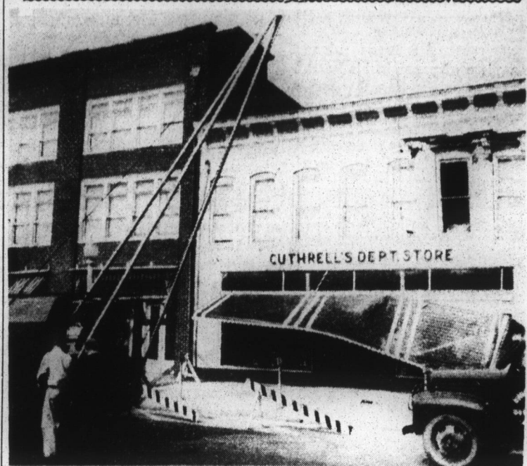
Above is seen the boom on an Electric and Water Department truck which hit a wire extending across Broad Street from Cuthrell's Department Store to the Hughes-Parker Hardware Store Tuesday morning of last week. The wire was used for Christmas decorations and pulled out a portion of the Cuthrell building and falling bricks ruined a metal awning. Nobody was hurt in the accident and damage was estimated at several thousand dollars.