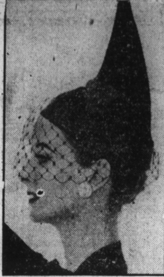
POINTED FASHION —Bound and bowed in coarse black ribbon, pixie hat of black velvet makes a point of high fashion with its mesh veil. It was first on display in London, England.

Bottled by J. A. ROBERTSON'S SONS, Inc. Distillers Philadelphia, Pa.