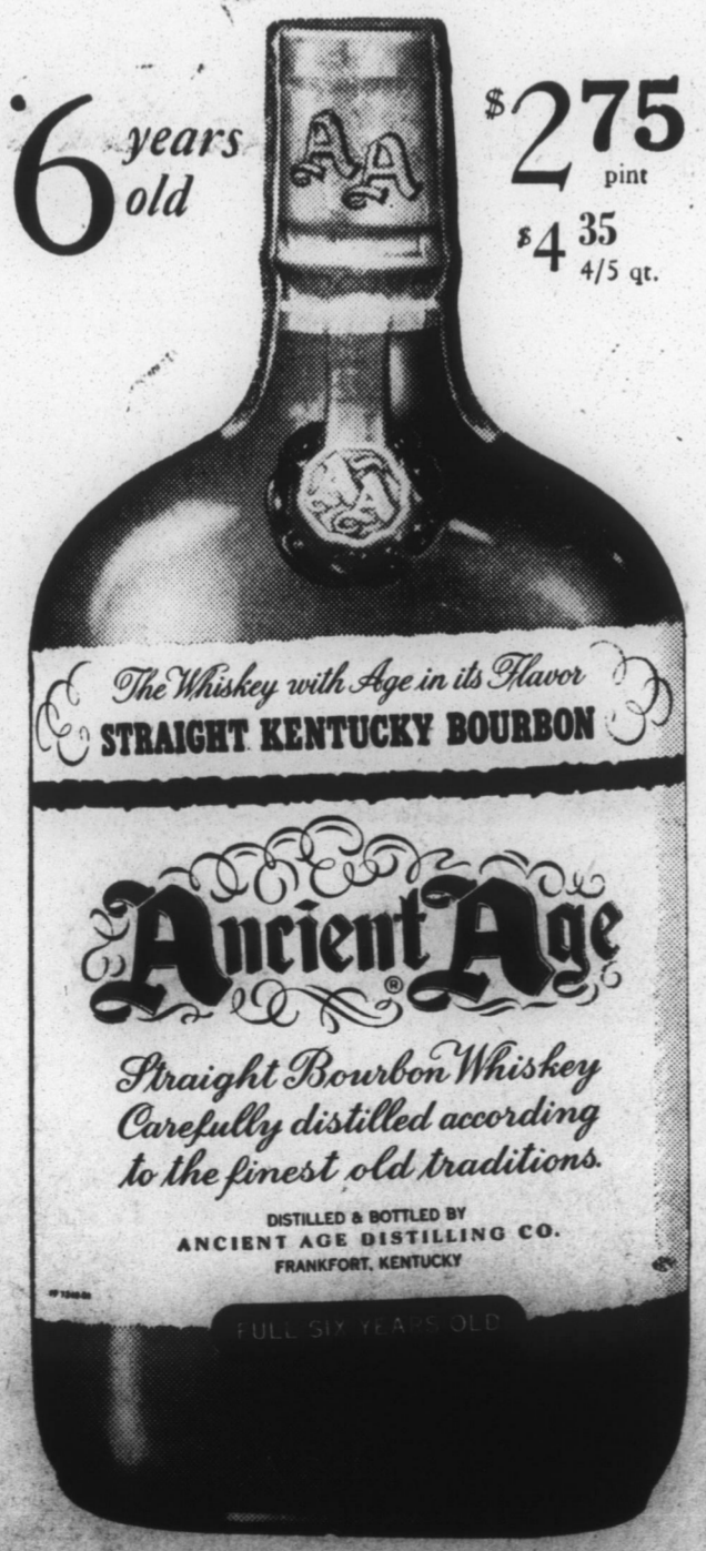
STRAIGHT KENTUCKY BOURBON WHISKEY, 86 PROOF ANCIENT AGE DISTILLING CO., FRANKFORT, KY.