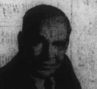
Governor Luther H. Hodges, who leads North Carolina's development program, invites you to write for the new RESEARCH TRIANGLE booklet.

Dedicated men and women, at work with fantastically complicated instruments and simple test tubes, are shaping a brighter future for every North Carolinian. In the seclusion of great public institutions and in private laboratories from the Great Smokies to the Atlantic Ocean, they are creating the miracles of modern science. They are the brains, the flesh and blood, of the Research Triangle. Their work has already made every book, every article, about North Carolina's economy that was written even a year ago out of date. The Research Triangle is a new and dynamic North Carolina First. Every citizen owes it to himself to know what it is, and what it means to his and his State's future.