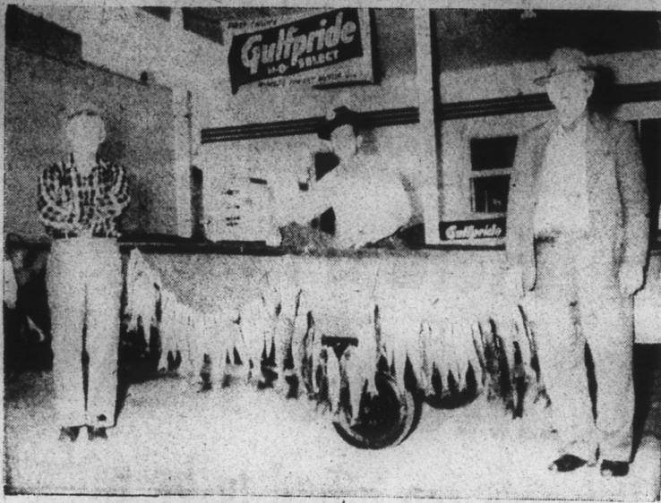
Three local fishermen struck a piece of luck last week when they landed 59 rockfish in Albemarle Sound...