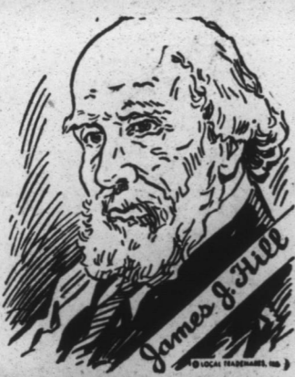
James J. Hill

We serve to the full extent of our ability. With diligent and intelligent study we seek to add to our capacity for service.