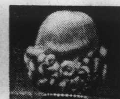
Set with Satin-Set, hair keeps curl... even when it's humid!