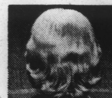
Set with "ordinary" spray, hair loses curl fast, soon gets droopy